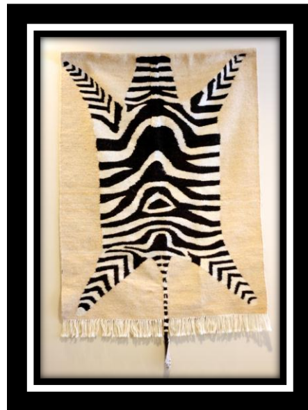
Description: Zebra Rug Artist: Unknown

This zebra skin and fabric rug was made and purchased in West Africa.