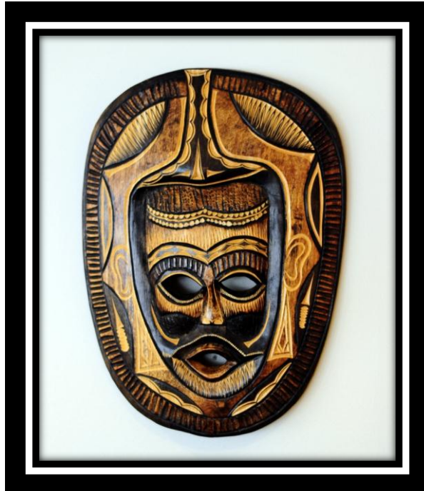
Description: Wooden Mask Artist: Unknown

This wooden mask was purchased at an art shop in Johannesburg, South Africa.