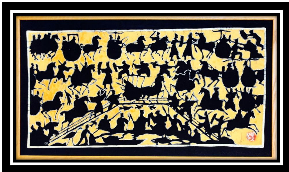
Description: Chinese Print Artist: Unknown