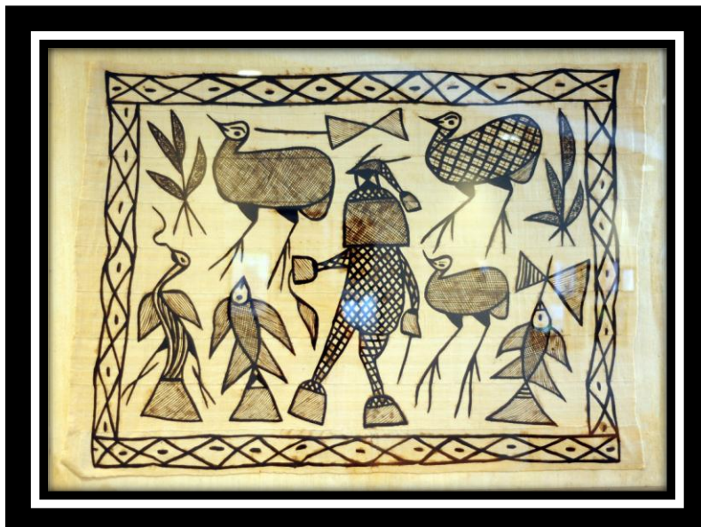
Description: Embroidered Cloth Artist: Unknown

This wooden mask was purchased at an art shop in Johannesburg, South Africa.