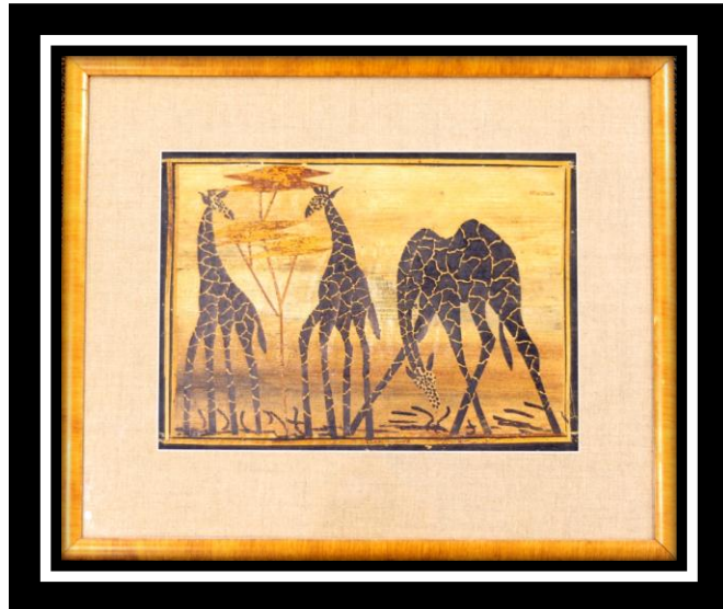
Description: Bark Paintings Artist: Unknown

This collection of eight painted bark animals and figures was purchased in West Africa. The cloth-like material that is used is taken from the inner bark of certain trees, beaten and softened into a paper-like substance. Then, the artist uses scratching and painting techniques to produce images. The artform originated in Australia.