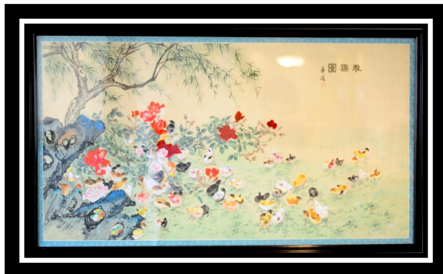
Description: Chinese Watercolor Artist: Unknown