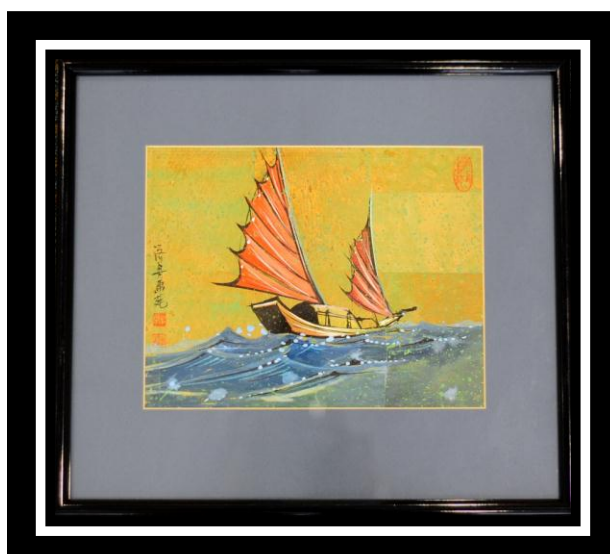
Description: Chinese Artist: Unknown