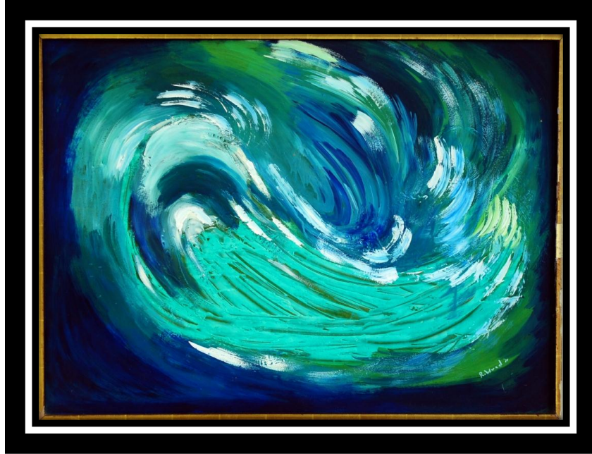
Description: Oil Painting Artist: Unknown