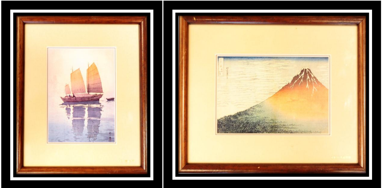
Description: Chinese Watercolors Artist: Unknown