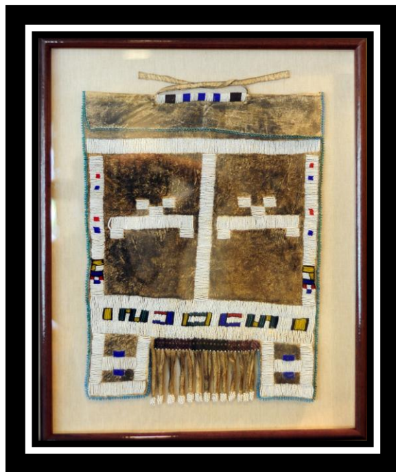
Description: Wedding Garments