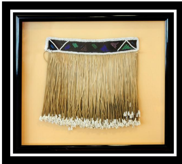
Description: Beaded Loincloth (Wedding Garment)