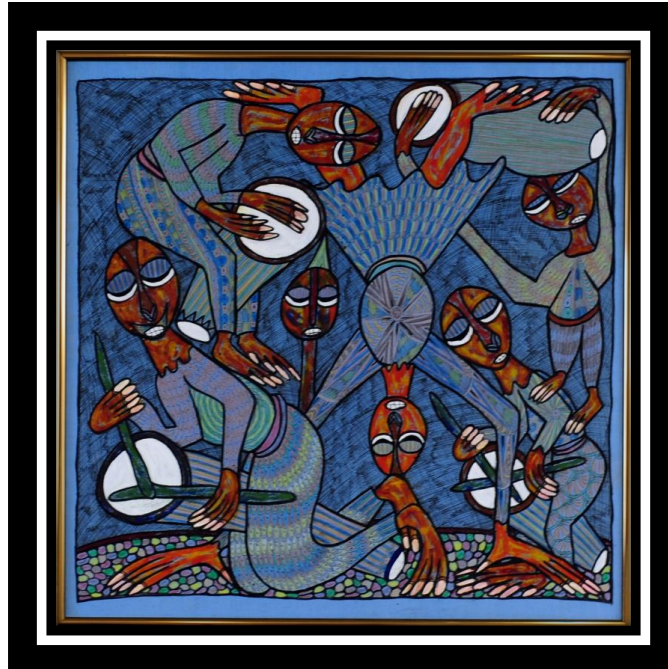
Description: Artist: Unknown