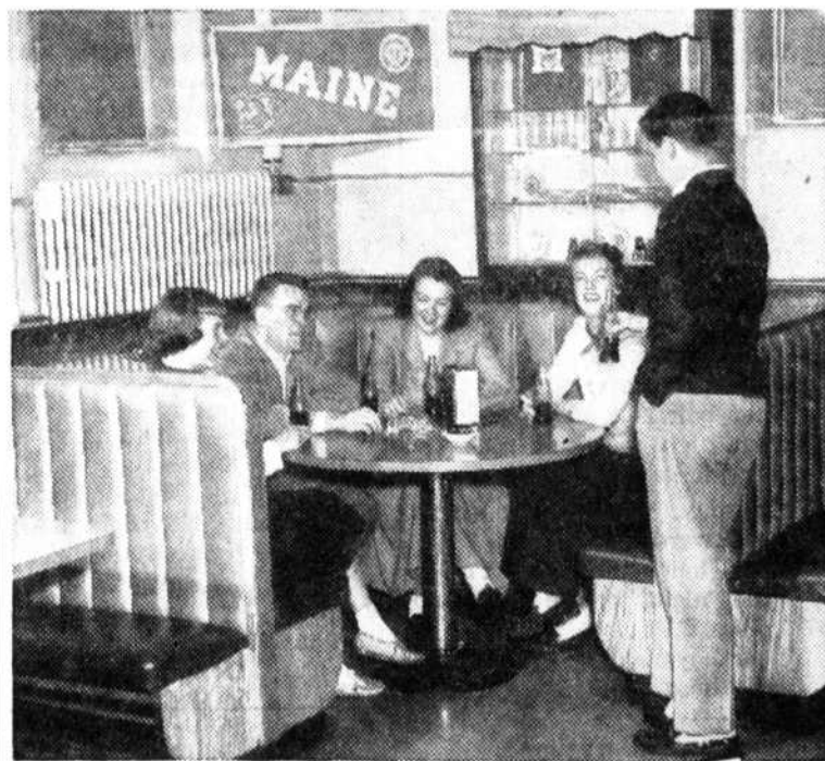
Snack Bar in Carnegie Library University of Maine Orono, Maine